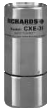
(Cover not shown)